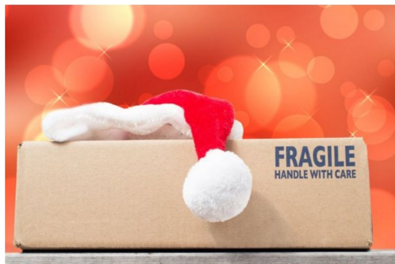
New research found that eight out of 10 people either overspend or have a spouse or partner who overspends during the holiday season.